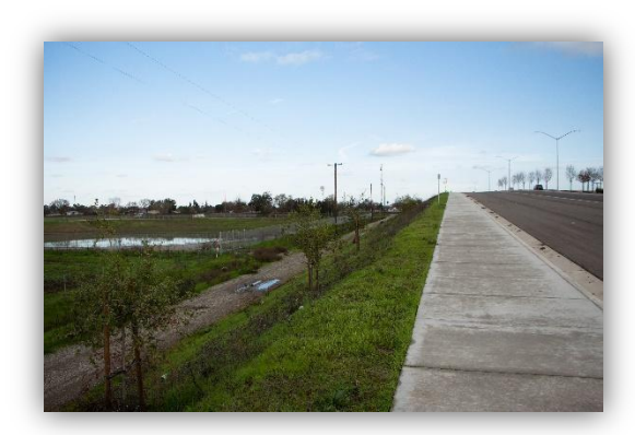
Figure 3 - Capital improvement projects such as roadways must include post-construction design measures and be appropriately sized.

If a redevelopment project results in an increase of <u>more than</u> 50 percent of the impervious surface of a previously existing development, runoff from the entire project, consisting of all existing, new, and / or replaced impervious surfaces, must be included in the selection and sizing of site design measures, LID design standards, and hydromodification management measures to the extent feasible. However, if the redevelopment project results in an increase of <u>less than</u> 50 percent of the impervious surface, only runoff from the new and /or replaced impervious surface must be included in the selection and sizing of site design measures, LID design standards, and hydromodification management measures.