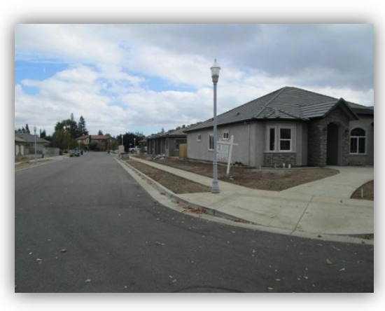
Figure 2 - A single family home that creates and / or replaces 2,500 ft<sup>2</sup> or more is a small project.

For the purposes of this Post-Construction Standards Plan, a "Regulated Project" is one that will create and / or replace 5,000 ft² or more of impervious surface. Regulated Projects include new and redevelopment projects on public or private land that fall under the planning and permitting authority of the municipality. Redevelopment is defined as any land-disturbing activity that results in the creation, addition, or replacement of exterior impervious surface areas on a site