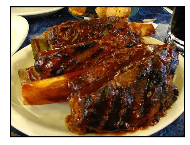
Revised March 16, 2018