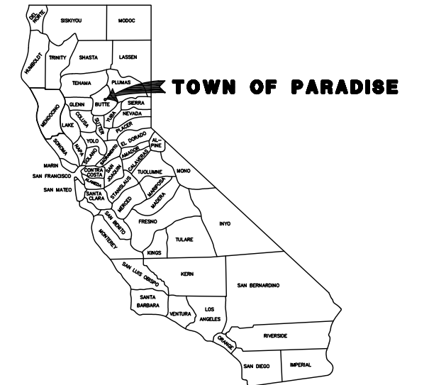
CALIFORNIA STATE MAP NO SCALE

SUPPLEMENTED BY CALTRANS STANDARD PLANS DATED 2023 & CALIFORNIA MANUAL ON UNIFORM TRAFFIC CONTROL DEVICES (CA MUTCD) DATE 2014 & WORK AREA TRAFFIC CONTROL HANDBOOK (WATCH)